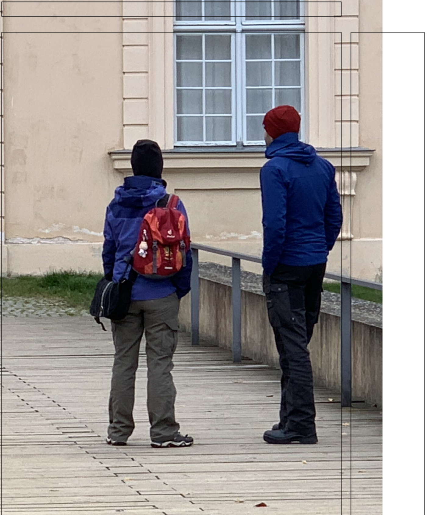
Figure 10: A caption for a double-sided image that will be placed on the right side of the right-hand part of the illustration. The illustration begins on the left edge of the paper. A short form is used for the LOF. The parameter is doubleFULLPAGE