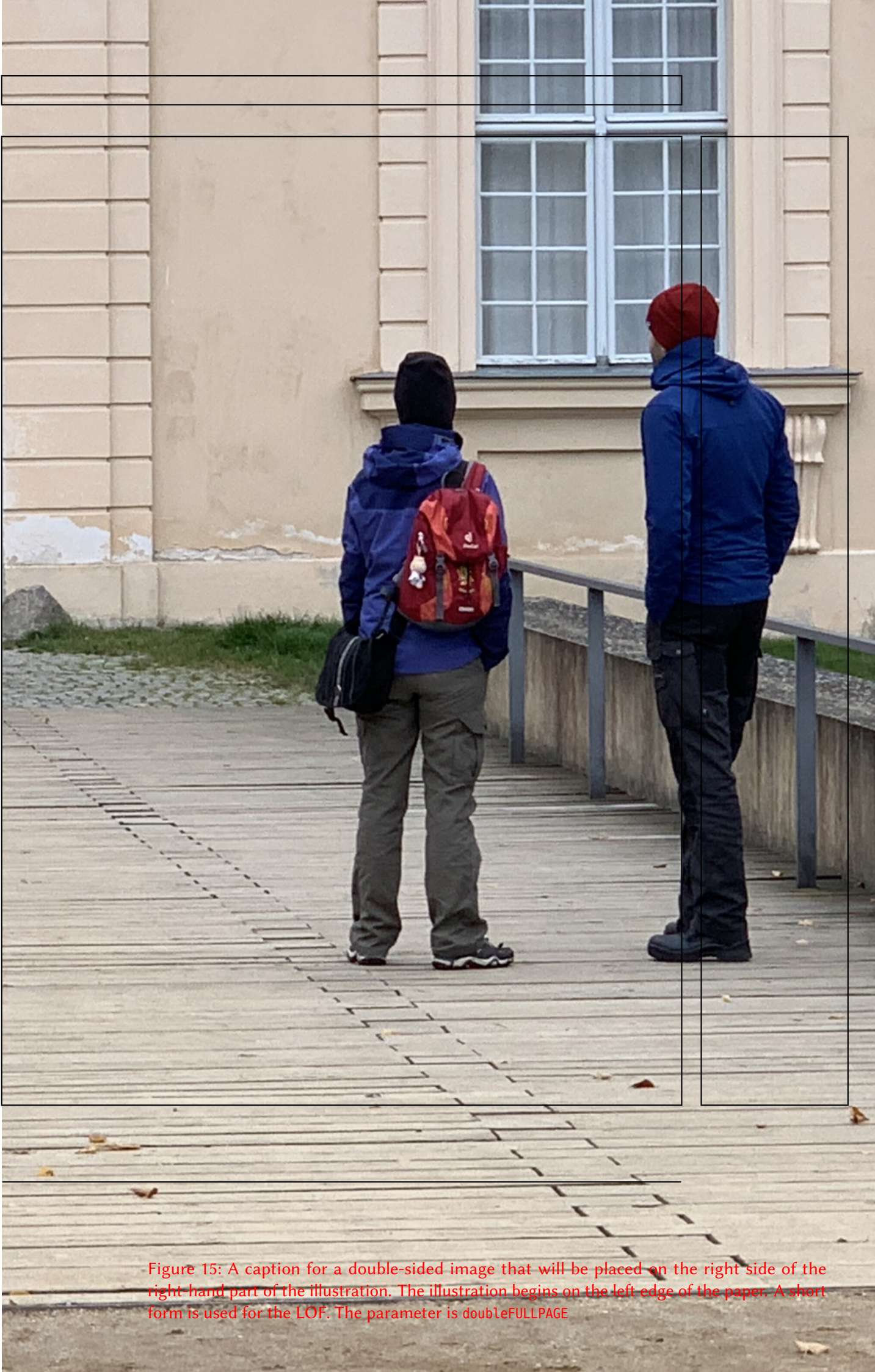
Figure 15: A caption for a double-sided image that will be placed on the right side of the right hand part of the illustration. The illustration begins on the left edge of the paper. A short form is used for the LOF. The parameter is doubleFULLPAGE