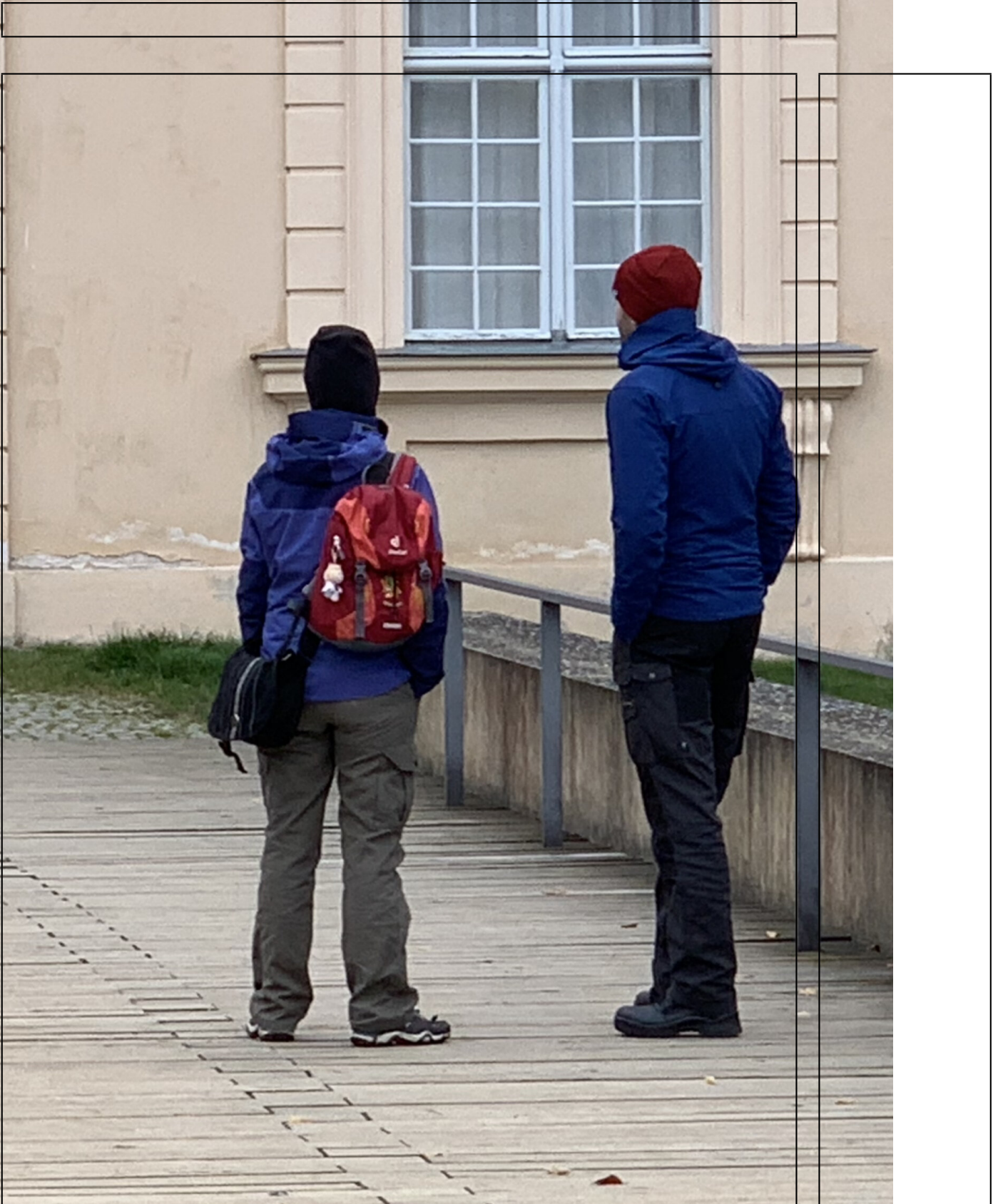
Figure 9: A caption for a double-sided image that will be placed on the right side of the right-hand part of the illustration. The illustration begins on the left edge of the paper. A short form is used for the LOF. The parameter is doubleFULLPAGE